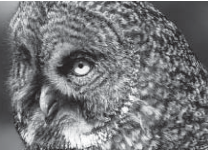
GREAT GRAY OWL • GORDON COURT

This document is a product of a National Nocturnal Owl Monitoring workshop held in Winnipeg on September 27-28, 1999.