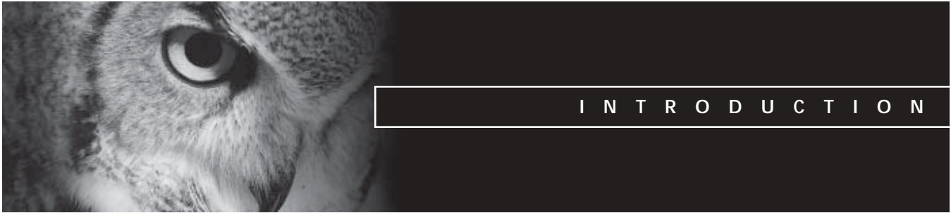
GREAT HORNED OWL • GORDON COURT