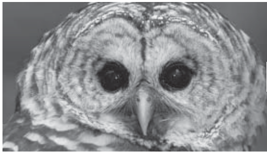
BARRED OWL • GORDON COURT