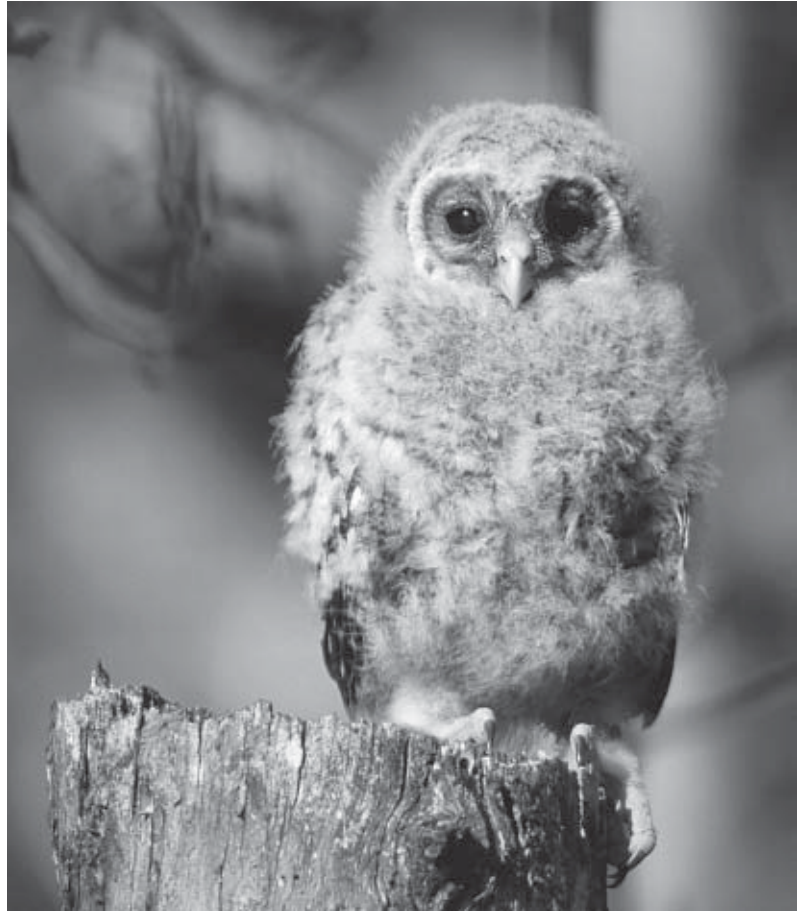
BARRED OWL •