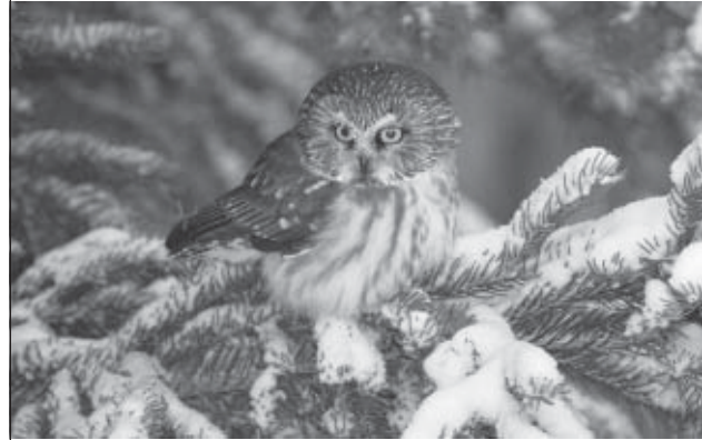
NORTHERN SAW-WHET OWL • GORDON COURT

regions. Ten species of owls have been identified including: Barred Owl, Boreal Owl, Great Gray Owl, Great Horned Owl, Long-eared Owl, Northern Hawk Owl, Northern Pygmy Owl, Northern Saw-whet Owl, Short-eared Owl, and Snowy Owl.