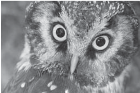
BOREAL OWL •

To monitor owl populations, data must be analysed regularly, and the results made available to the public, to managers, and especially to participants to encourage them to participate in the survey. Regular correspondence at least twice a year is desirable to maintain their interest.