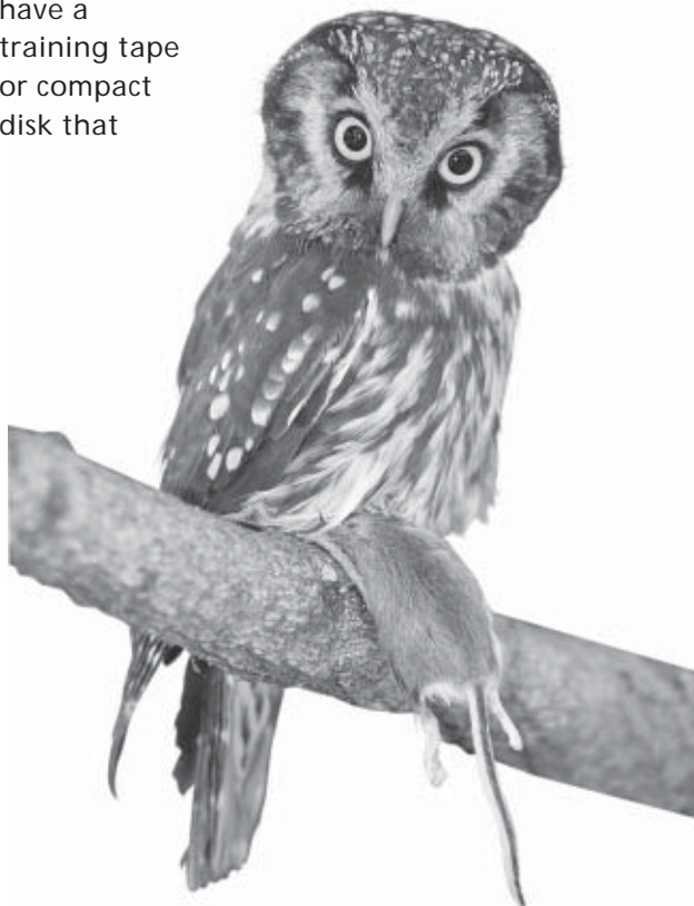
BOREAL OWL • GORDON COURT

Surveyors must be able to identify, by vocalizations, all species of owls that regularly occur in their area. Although many people may be familiar with the most common vocalizations of each species, owls may give variants on their calls, and some species such as Long-eared Owls have a wide variety of vocalizations. As a result, participants should have a training tape or compact disk that