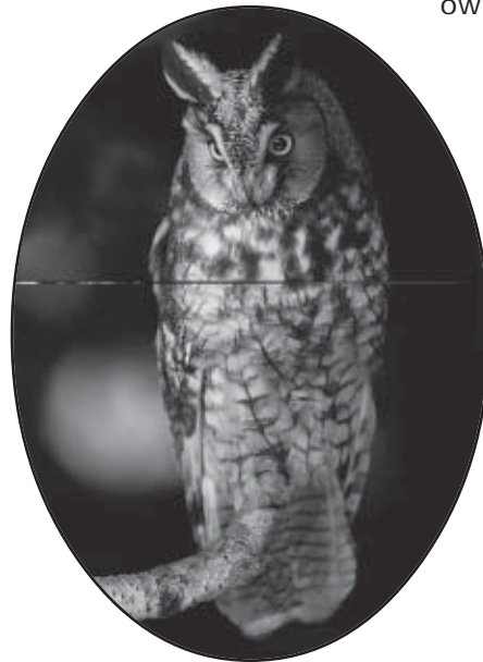
LONG-EARED OWL • GORDON COURT