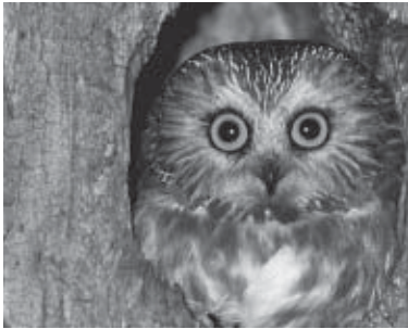
NORTHERN SAW-WHET OWL • GORDON COURT