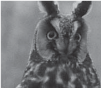
LONG-EARED OWL • LISA TAKATS