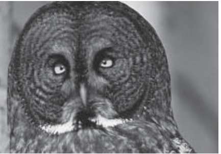
GREAT GRAY OWL • GORDON COURT

Owl surveys lend themselves to being run by volunteers, because relatively little experience is required. The volunteers should be able to meet two basic requirements: ability to identify a small suite of owl species, and ability to keep track of where they are.