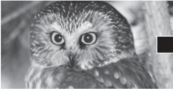
NORTHERN SAW-WHET OWL • LISA TAKATS