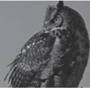
GREAT HORNED OWL • GORDON COURT

The methods recommended in this report are based upon the best information available to us during compilation of this report. We believe they provide a sound basis for developing owl monitoring protocols that will provide comparable data across North America.