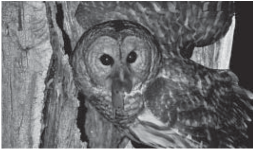
BARRED OWL • GORDON COURT